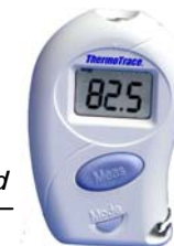
15031 Mini Trace Infra Red

Light-weight and compact design Similar size to a car key Instant and Accurate Temperature Measurement Automatically displays time when not measuring temperature