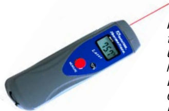
15030 Infra Red Hand Held

Instant non-contact surface temperature measurement Useful with moving objects Most accurate infrared thermometer in its class Can be calibrated Fully waterproof model also available!