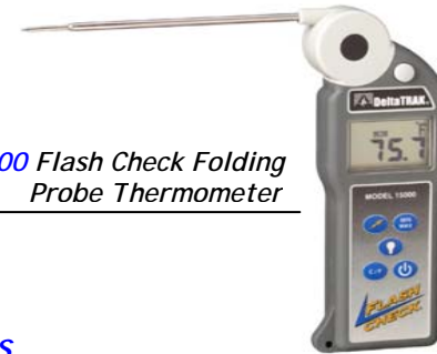
15000 Flash Check Folding Probe Thermometer

Multi-Purpose Testing Suitable for Food and Dishwasher Temperatures!