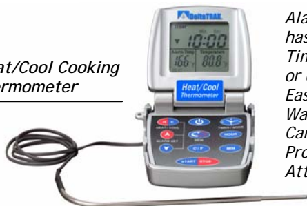
26000 Heat/Cool Cooking Thermometer

Alarms when cooking or cooling temperature has been reached Timer tracks cumulative cooking or cooling time Easy to clean heat resistant teflon wire Waterproof probe Can be calibrated Probe can be placed in oven Attach with magnet or metal clip